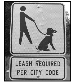
A local ordinance

State constitutions also authorize state legislatures to pass state laws. The state laws are also called statutes, and they only apply inside the state. Often, state statutes allow local governments to pass their own laws. Local laws are usually called ordinances , and they only apply within local boundaries, such as within a city or county.