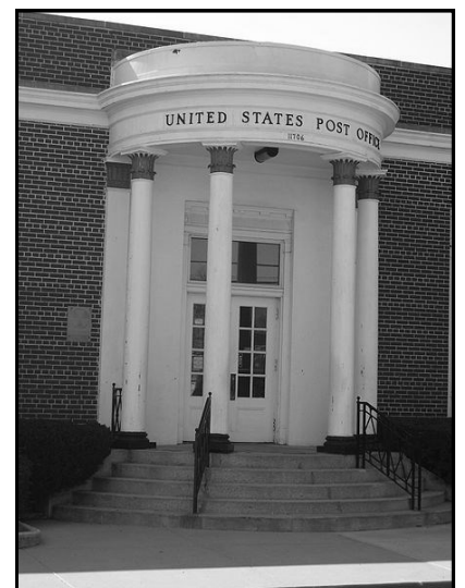
A post office in New York

For example, the Constitution says Congress has the power to "establish post offices" and pass any laws "necessary and proper" for carrying out that power. This means that Congress can establish post offices and pass all the laws needed for running a postal service. In the part of the U.S. Code that deals with post offices, you would find a statute that establishes the United States Postal Service. You would also find many other statutes having to do with running the U.S. Postal Service. There are statutes about what can and can't be sent through the mail, how the Postal Service must manage its money, working for the Postal Service, and many more.