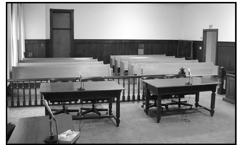
Judge's-eye view of a typical courtroom

Laws can be divided into two main categories: criminal and civil. The sources of law you just read about create both kinds of laws. However, courts treat criminal and civil cases differently.