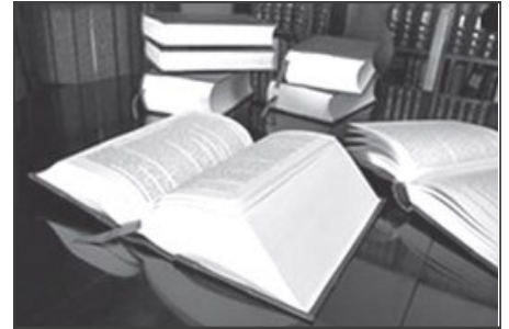
A collection of law books.

Laws keep our society running as smoothly as possible. When you think of the law, you probably think of rules that say what people can and can't do. We all know that you cannot steal from others without getting into trouble. That's one example of a law, but most laws set rules for how things work. There are laws about how people buy and sell property, how we elect government officials, and how activities in daily life should work . Where do all these laws come from? There are three main sources of law in the United States: constitutions, statutes, and regulations.